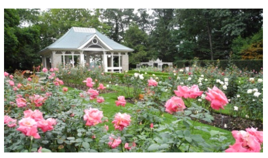
Fellows Riverside Gardens

End your day at <u>Mastropietro Winery</u>. Enjoy wine tastings in a beautiful setting. Group-friendly dining for your group can also be arranged.