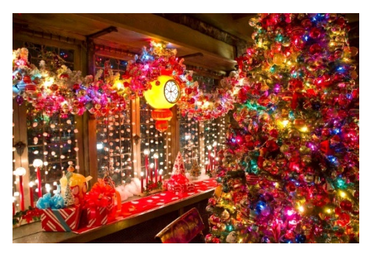
Memories of Christmas Past

Enjoy an evening holiday performance at the <u>Best Western Plus Dutch</u> <u>Haus Inn & Suites Dinner Theater</u>. Then enjoy one million holiday lights in 80 animated light scenes at the drive-through <u>Joy of Christmas Holiday</u> <u>Light Show</u>. Stroll through the Gingerbread House and view hundreds of homemade gingerbread house displays. Stop by the Ice Castle for entertainment, and Santa!