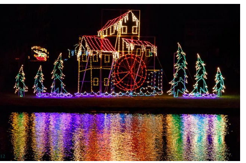
Joy of Christmas Holiday Light Show