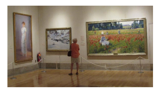
The Butler Institute of American Art

Visit the <u>Youngstown Historical Center (Steel Museum</u>) for a unique look into the steel industry and how it shaped the Mahoning Valley. Enjoy a delicious treat from <u>Handel's Ice Cream</u> on the way home. A Youngstown tradition!